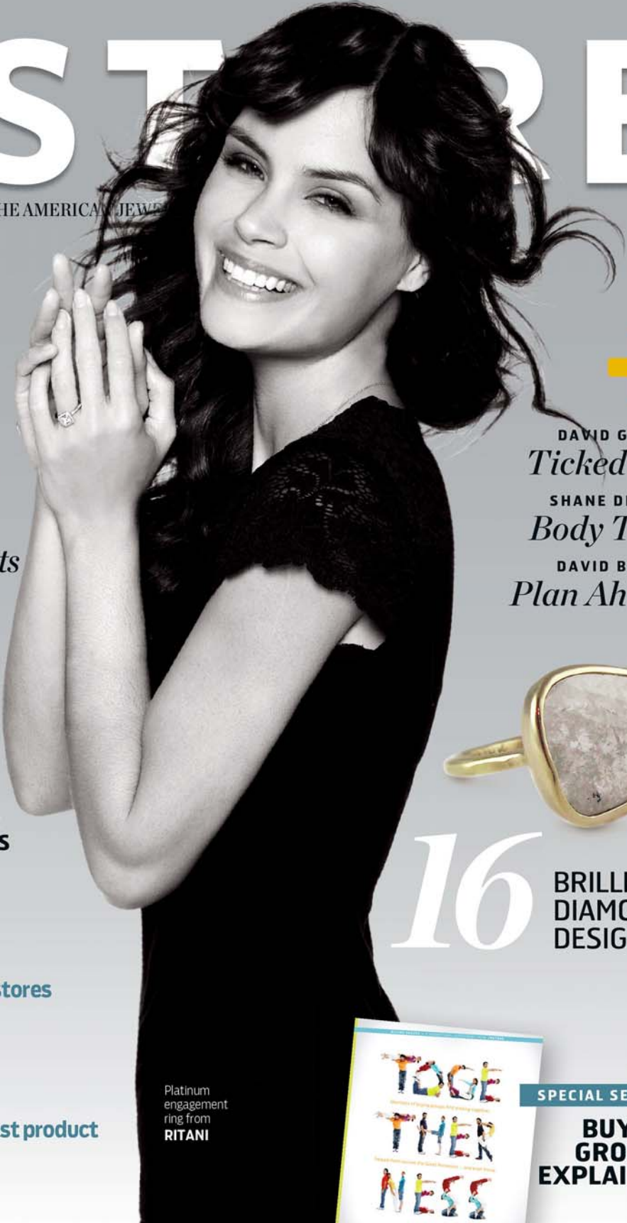
Platinum engagement ring from RITANI

New looks for the year's hottest product